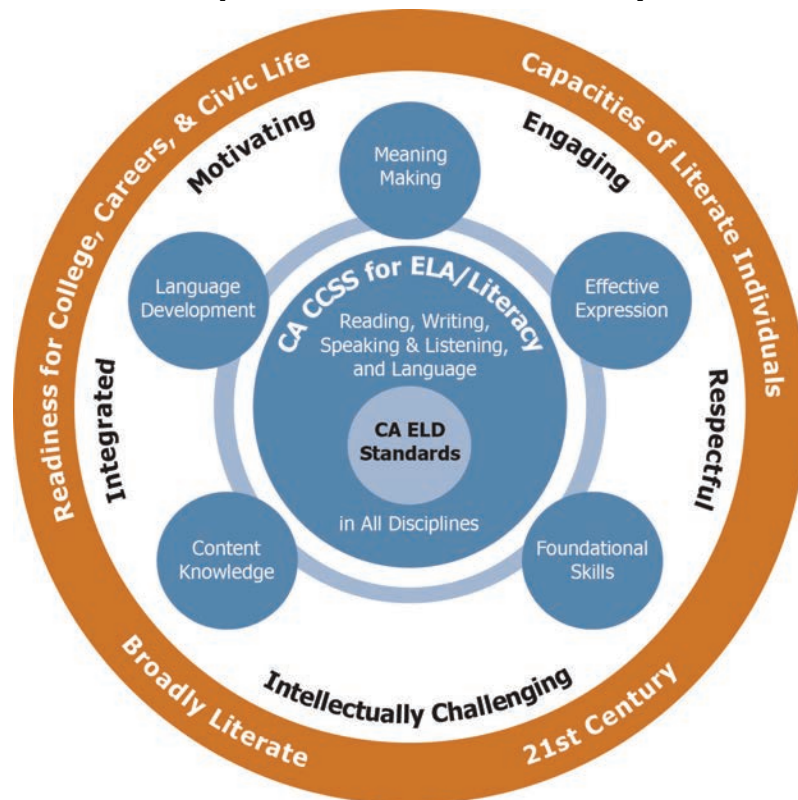
Figure 9.1. Circles of Implementation of ELA/Literacy and ELD Instruction

The United States Department of Education highlights the need to strive for equity in U.S. schools: