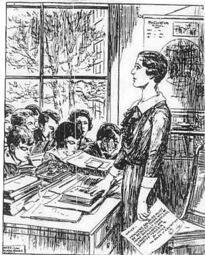
American School Board Journal, Dec., 1933