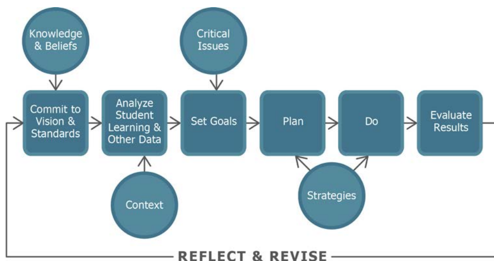
Figure 12.3. Professional Development Design Framework

Long description of Figure 12.3.