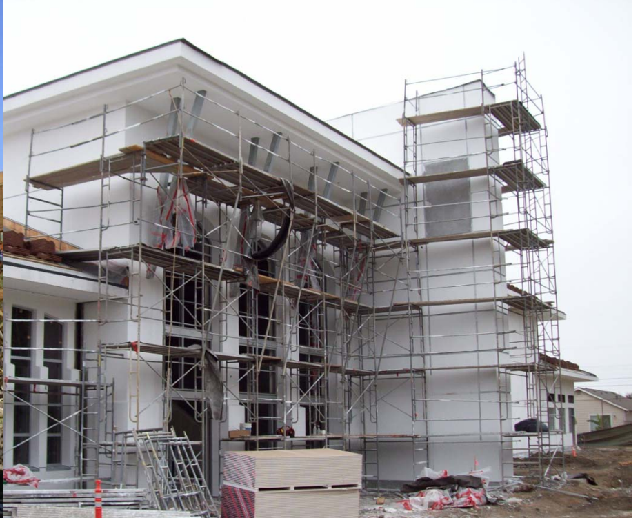
Downer Elementary Main Campus