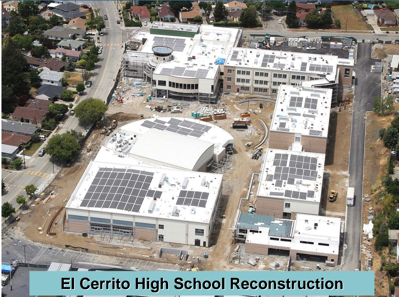
El Cerrito High School Reconstruction