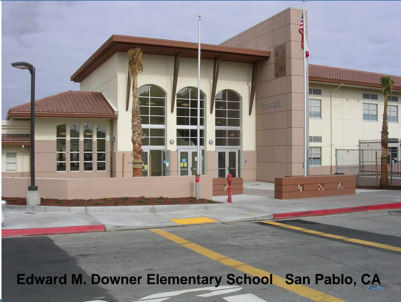
Edward M. Downer Elementary School San Pablo, CA