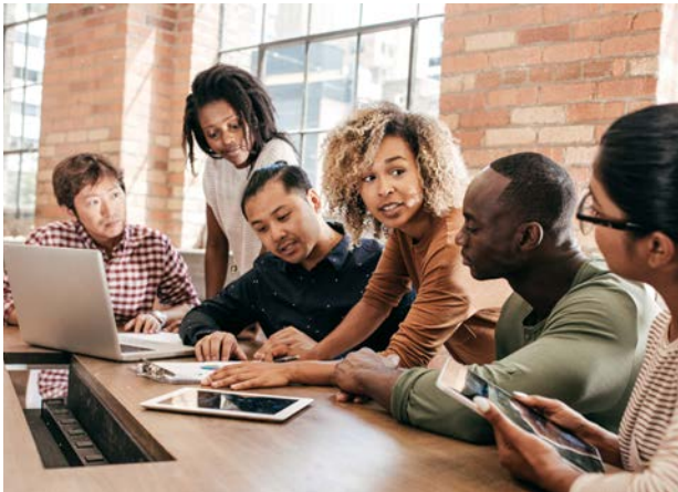
Assessment analysis allows teachers to develop methods for preparing students for the CCSS and future testing.

attended daylong conferences offered by the San Diego County Office of Education titled “Getting Smarter About Common Core Assessment.” The district team brought back many ideas to support the district’s implementation of the CAASPP System to support teaching and learning.