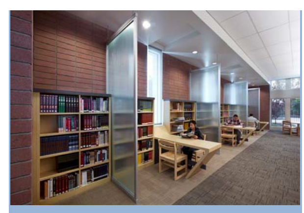
Flexible, small group and individual spaces support 21<sup>s</sup> century learners

Just as instructional practices continue to change, so do the methods for food preparation and service in schools. With greater attention to balanced nutrition and healthy lifestyles, our school kitchens, cafeterias, and lunchrooms need to be reconfigured. Frankly, redesign of existing schools is a health and equity issue as we enter the second decade of the 21<sup>st</sup> century.