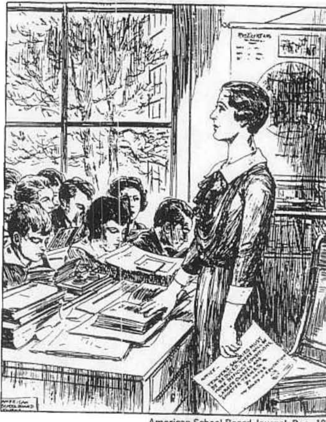
American School Board Journal, Dec., 193

for a couple of months. "I was finally persuaded by my family that no job was worth that."