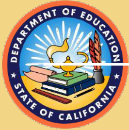
Tom Torlakson State Superintendent of Public Instruction