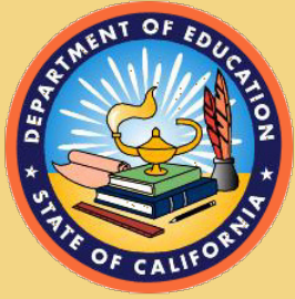
Tom Torlakson State Superintendent of Public Instruction