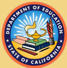
Tom Torlakson State Superintendent of Public Instruction