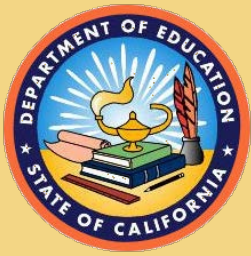
TOM TORLAKSON State Superintendent of Public Instruction