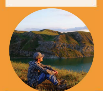
Spend time in nature Take a hike Watch the sunset Stargaze