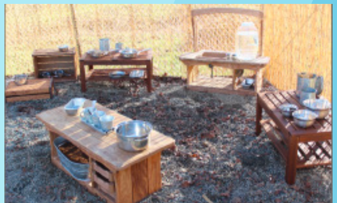
Palermo Union Elementary School