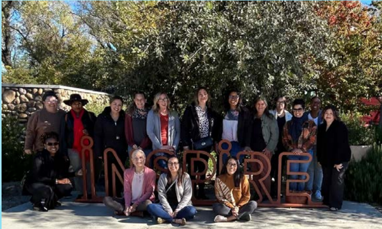
FSW Meeting, Redding, November 9, 2022

At the November 2022 meeting, CDE staff presented resources and training on Eligibility, Recruitment,