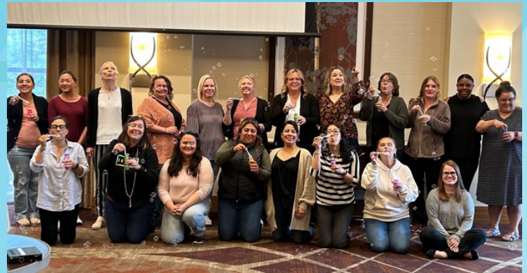
FSW Meeting, Redding, May 3, 2023

from new partners and partners who've been with the grant since the beginning. Again, information was shared in each area – ERSEA, Family Engagement, Education, Health, Nutrition and Dental, Disabilities and Mental Health. Information and resources were shared throughout the meeting on staff wellness and mindfulness, including a book for Family Service Workers with a variety of mindfulness activities for self-care and supporting families. The Equity work group gave an emotional update on the impact of racism on Black Boys and their work with the larger Region IX Equity cohort. We had a guest speaker from Far Northern Regional Center on the process of referral to services for infants and toddlers, and some of the supports available to families. Another guest speaker shared information on Dental services through MediCal. Five books were provided for each FSW, Center, and Family Child Care home to start Parent Libraries with books for families on development, parenting, financial literacy, trauma and nutrition. Presentation were also shared on Post-Partum Depression and Early Education Staff Wellness by CDE staff who graduated from the Napa Infant-Parent Mental Health Fellowship, and a preview of the work being planned with Mom-Net, a maternal depression support, was shared.