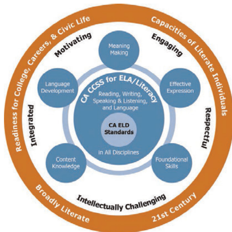
Figure 7.1. ELA/ELD Framework Circles of Implementation

An accessible long description of figure 7.1 is available at https://www.cde.ca.gov/sp/se/ac/ch7longdescriptions.asp#figure1 .