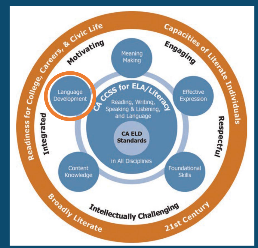
Figure 2.1 The ELA/ELD Framework Circles of Implementation