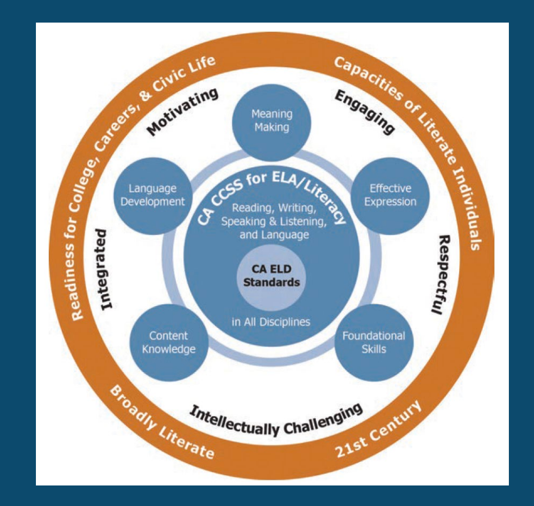
Figure 2.1 The ELA/ELD Framework Circles of Implementation