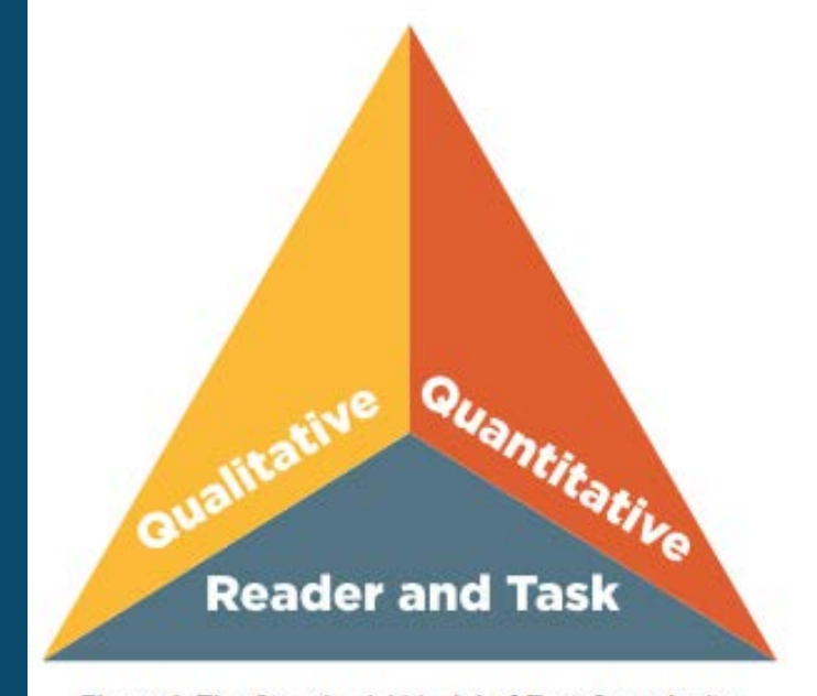
Figure 1: The Standards' Model of Text Complexity